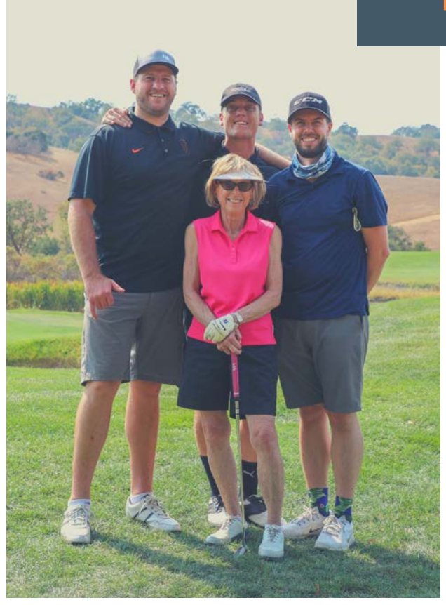
Attendees of the 12th Annual PACE Golf Classic