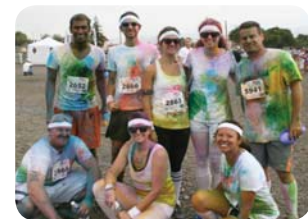
FACES staff and friends at Color Me Rad 2012

The new space is light and spacious and located on the first floor of a small office park of professional buildings surrounded by green open space. We look forward to welcoming you in our new facility.