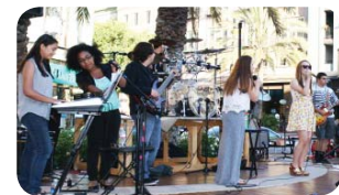
Cold Suspension at Santana Row Concert