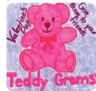
Middle School Fundraiser poster

Learn more about volunteering at PACE at http://pacificautism.org/about-pace/volunteer/ .