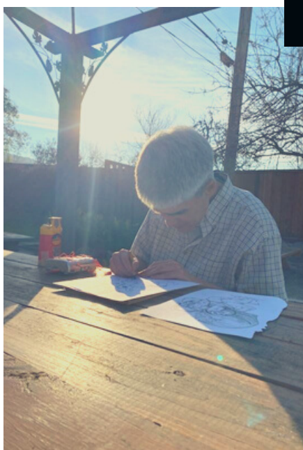
Residential Client enjoying the sunshine

The return of the BARER 2022 event at the Half Moon Bay Ritz Carlton venue was a flashback to times past. The event was packed to capacity with the same level of energy and enthusiasm which led to a very successful fundraising event surpassing our budget's goal and raising $741K for PACE programs .