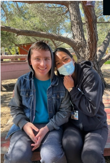
Student and staff enjoy a vocational outing

PACE successfully secured a location for its PACE School expansion . The new facility, located in Sunnyvale, CA, serves the PACE's School upper-age students, while the Santa Clara campus serves elementary-age students. The purchase of a new building was an exciting step to accommodate more families in the Bay Area.