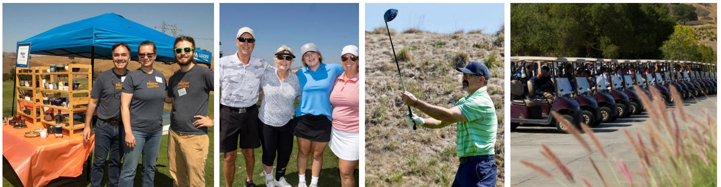
Photos from the 2022 PACE Golf Classic