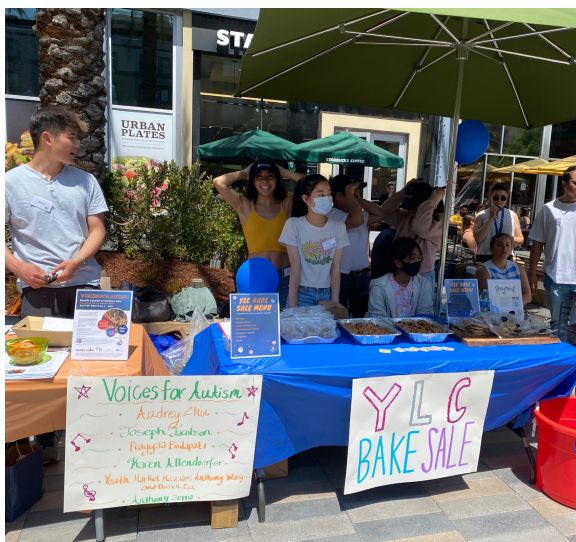
PACE YLC members tables at the Voices for Autism Benefit Concert