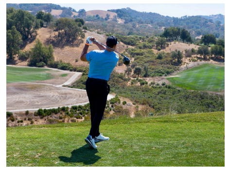
Photos from the residential program and the 15th Annual PACE Golf Classic.