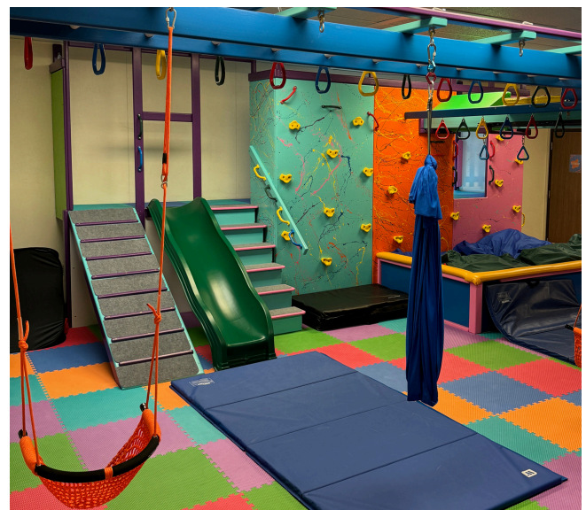
Sunny Days Preschool Occupational Therapy Gym.

At our Sunny Days Preschool and Faces clinic, we added resource rooms including a sensory gym, complete with swings, crash pads, rock-climbing walls, and a zipline, as well as a dedicated room for the Faces ABA clinic. Additional enhancements included a new BCBA office/workspace and an expanded staff lounge area. As these programs continue to grow, we are able to better serve our student population and provide expert care.