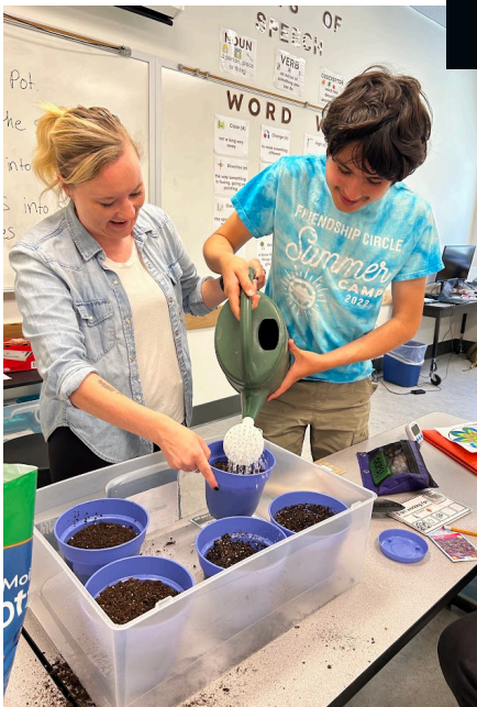
Student and staff enjoy a vocational outing.

PACE successfully opened its San Aleso Campus in September 2023. The new facility is located in Sunnyvale, CA and serves the PACE School upper-age students, while the Santa Clara campus serves elementary-age students. The expansion of our school program marks a significant milestone that reflects the dedication, commitment, and excellence of the entire PACE community.