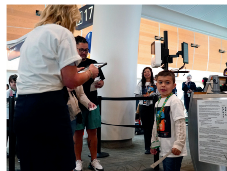
Photos from the Wings for All event