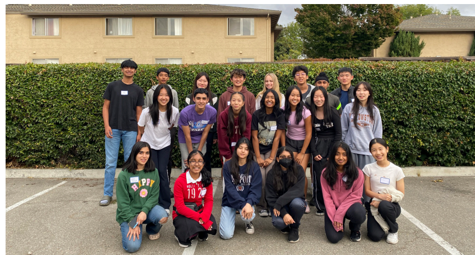
The PACE YLC (Youth Leadership Committee) is a group of high school students in the Bay Area committed to increasing awareness of PACE and autism in the community and raising money for PACE programs and services. In collaboration with PACE staff, the YLC participates in a variety of strategic and fundraising initiatives in order to sustain and deepen the mission and impact of PACE in the community.

We are grateful for the time and talents from our YLC members. Thank you for supporting PACE!