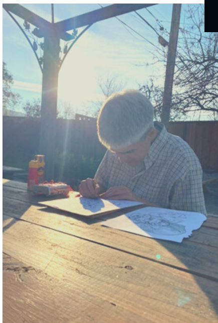
Residential Client enjoying the sunshine

The return of the BARER 2022 event at the Half Moon Bay Ritz Carlton venue was a flashback to times past. The event was packed to capacity with the same level of energy and enthusiasm which led to a very successful fundraising event surpassing our budget's goal and raising $741K for PACE programs .